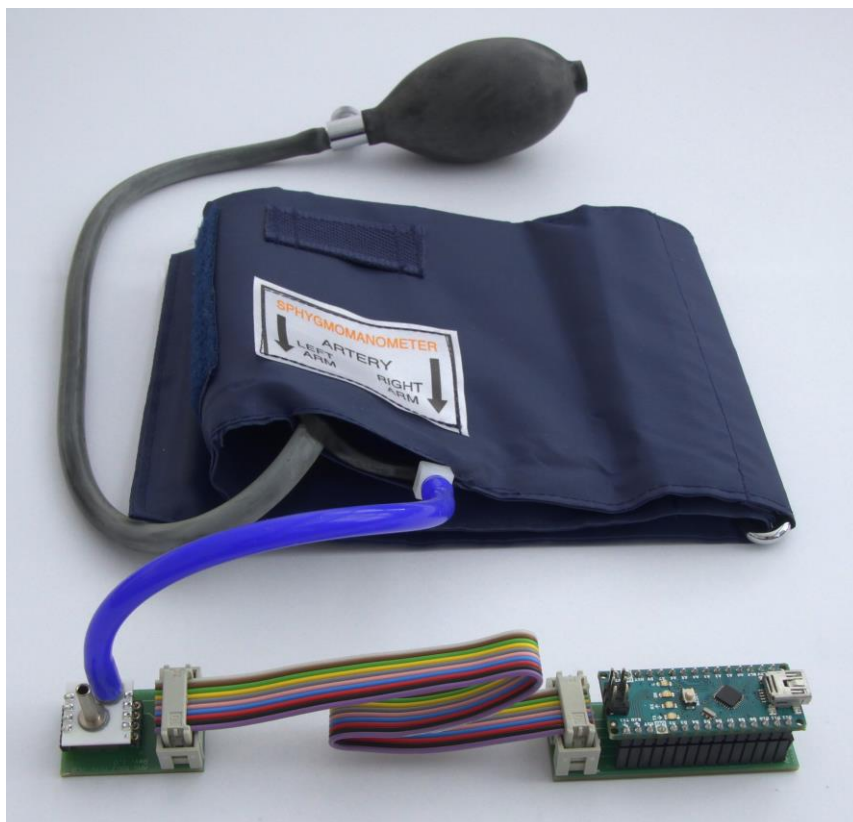
Figure 1: Measurement setup using an AMS 5915, Arduino Nano, the AMS 5915 Arduino Nano kit [4] and an inflatable cuff

The blood pressure is measured against air pressure, therefore a differential / relative pressure sensor is necessary. In most cases the systolic blood pressure is lower than 180 mmHg (= 239.98 mbar). In our setup we chose AMS 5915-0350-D for the blood pressure measurement with a minimum pressure of 0 mbar and a maximum pressure of 350 mbar.